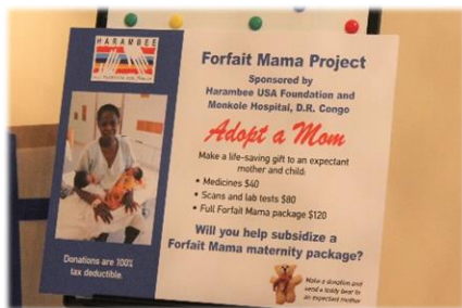
Forfait Mama fundraising event