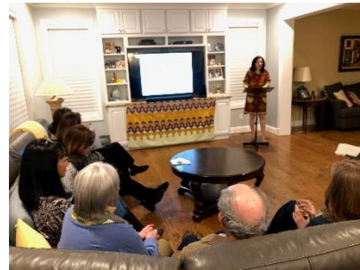
Dinner with Purpose